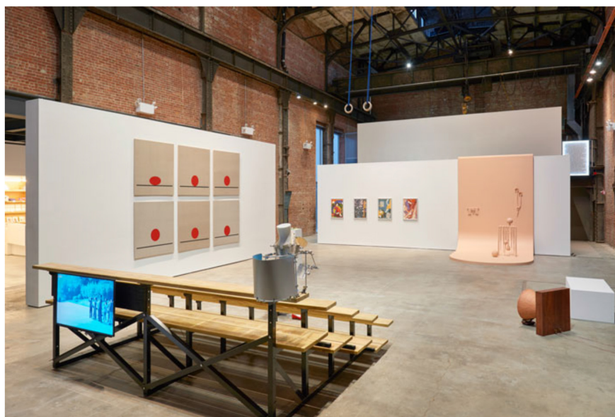
Installation view of 'The Eccentrics,' at SculptureCenter, 2016. KYLE KNODELL

BY Alex Greenberger POSTED 02/24/16 4:34 PM