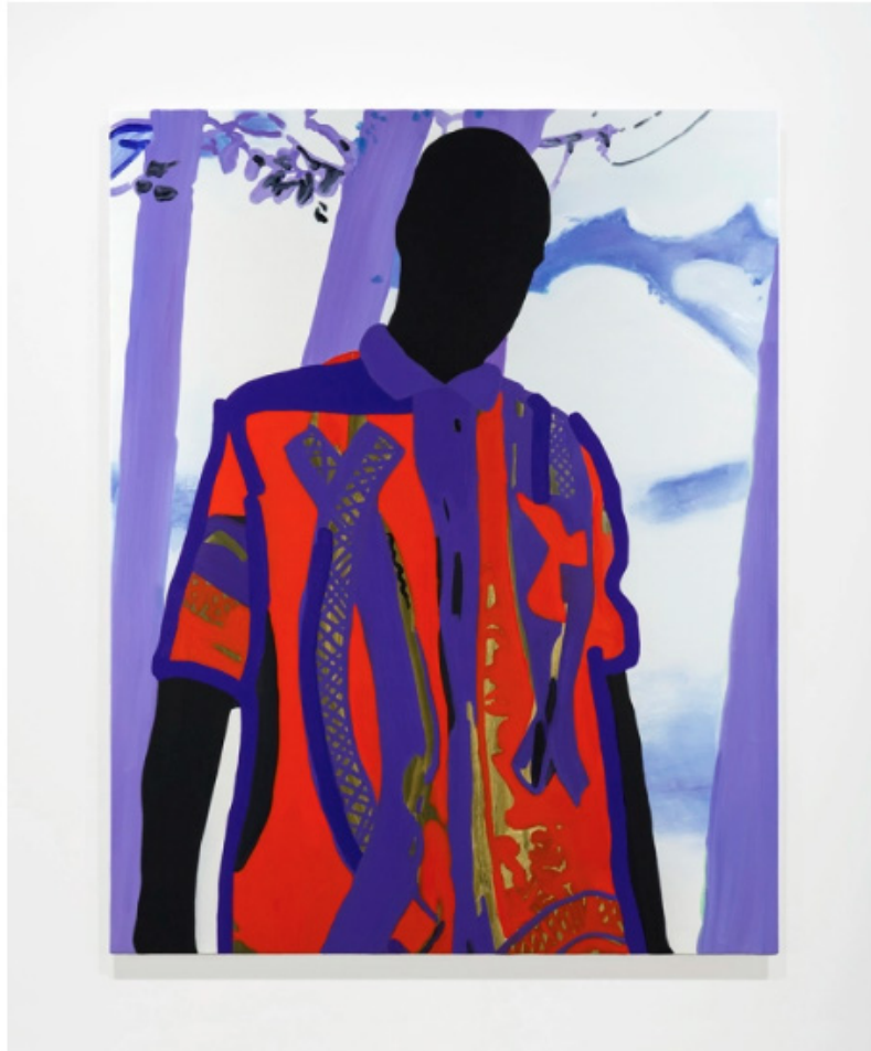
Image: Listen , 2018 by Elizabeth McIntosh.

combination of exterior influences mixed with personal everyday minutiae, but also the feelings she might have about them. Not applied like paint but more like patina, McIntosh's paintings allow us to feel via osmosis or absorption of colour and form, like sheets being stained.