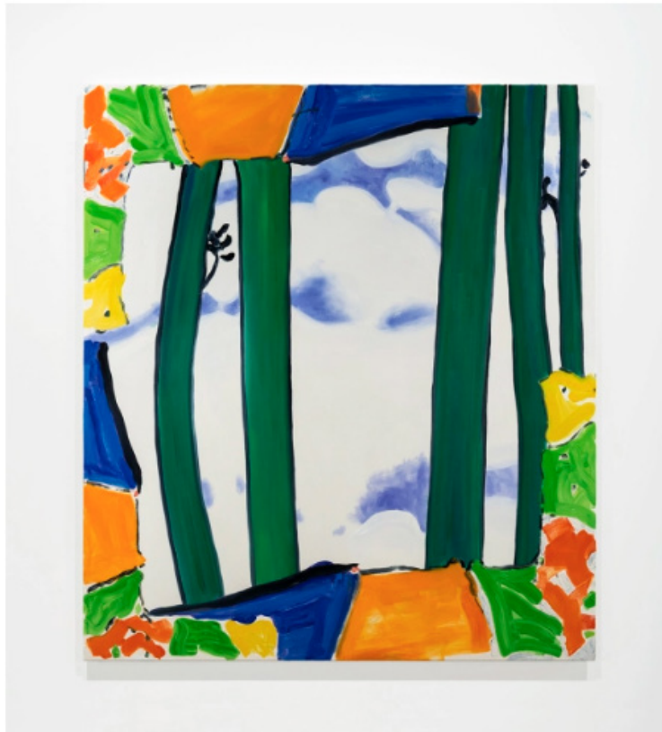
Image: Angels , 2018 by Elizabeth McIntosh.

particularly evident in the work titled Wild Grapes , where the seaweed-coloured trees become a purple sphinx's body, hovering somewhere above the point where the cat's legs begin. Declaring and celebrating the possibility of a conspicuous transition, McIntosh reinvents familiar forms and shapes via decisions that seem like chance meetings, moving us from the abstract into the surreal and representational, from the illusionistic mind to the sensational body.