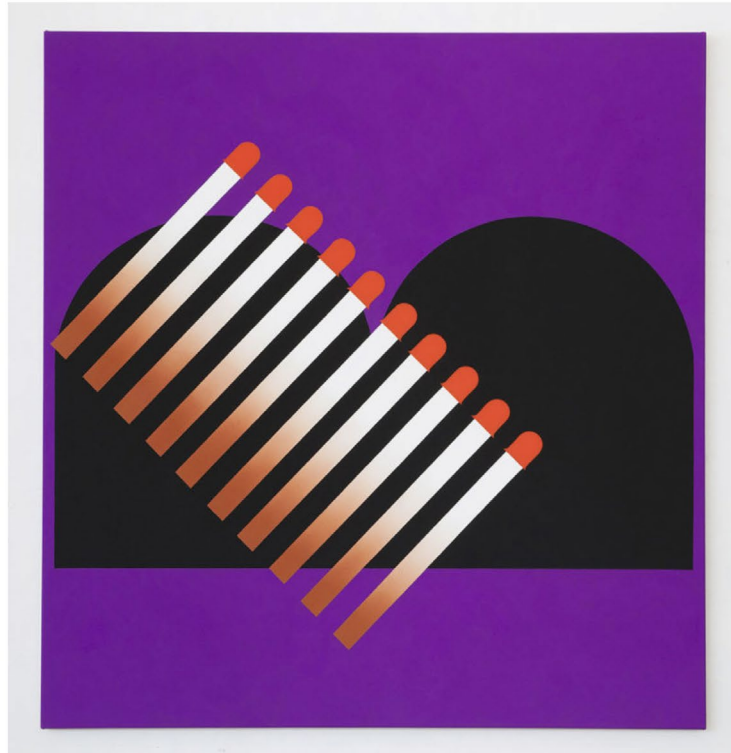
Math Bass, Newz! , 2018. Gouache on canvas. 42 x 40 inches. Courtesy of the artist and Mary Boone Gallery.

Susan Stewart: "Downy cheek against a beard: oh scratches // On the record, oh baby, oh measure / Oh strange balance that grips us / On this side of the world." I imagine Bass is thinking about this side of the world. I imagine there's nothing liminal about it. Why make Bass's work in-between and legible and graphic and inscrutable and stylized and illegible and ambiguous and familiar and non-narrative and flat and round as peaches? Nothing and nobody can sustain that much weight. Bass's notations are, to quote Siegfried Kracauer, "buried as if under a layer of snow," even as they present themselves to us without obfuscation, without withholding.