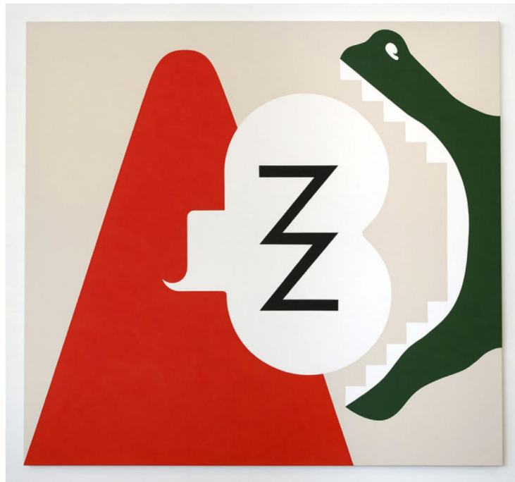
Math Bass, Newz , 2018. Gouache on canvas. 82 x 90 inches.

Kurfürstenstraße 156, 10785 Berlin +49 (0)30 21 972 220, info@tanyaleighton.com , www.tanyaleighton.com