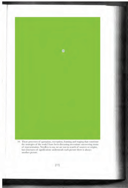
That's the truth.