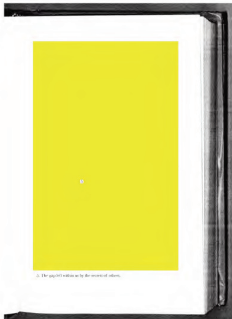
The space between things is more important than those things.