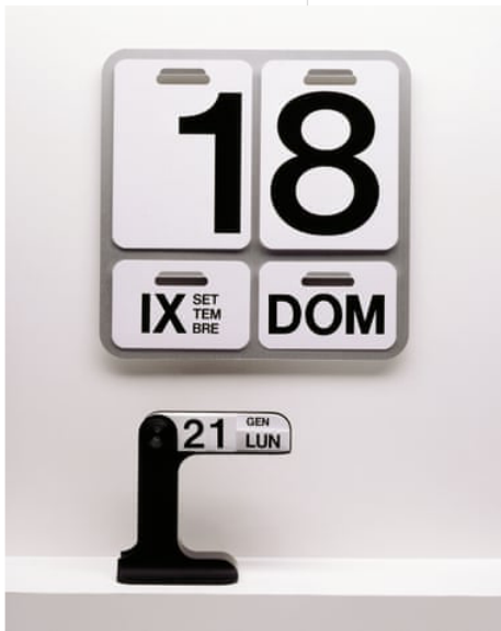
▲ Enzo Mari's wall calendar for Danese, which can be used in perpetuity.

While he strove to make his work affordable, he believed those making the products should be compensated well. Mass furniture, he told Icon magazine in 2009, was “cheap because of the blood of the people”. Nor was he keen on his peers producing high-end design, labelling most as “publicity whores”.