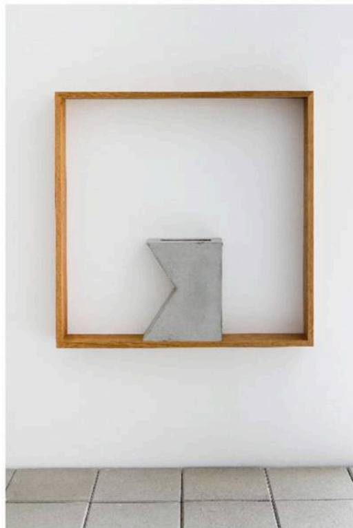
Spring Rain by Camilla Low

When there is an obsession in labelling and differentiating among artists, media and Crafts and Fine Arts, it is very liberating to find a space that combines both without such limitations and complete freedom. Belmacz is a space in Mayfair that shows jewellery alongside video art, conceptual artworks with antique coins; they even have a swing! His latest exhibition Dumb Rocks intends to set out a discussion between the works, centred around a phenomenological inquiry into the essence of Art. What is the relation between the objectivity of an Artwork - that is, its material being as an object, and its nature as an artwork. To what extent is the material objectivity of the work essential or incidental to the work, and how does this form carry the works concept or lack thereof? An exhibition of diverse new works by Tim Berresheim, Jess Flood-Paddock, Camilla Low, Oliver Osborne, Travess Smalley, Oliver Sutherland, including pieces by David Nash and Ettore Sottsass.