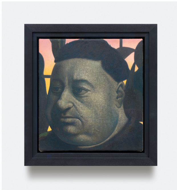
Portrait of a Fat Man at Sunset, 2021, Oil on linen 28 x 26 x 2,7 cm / 35 x 33 x 5, with frame.