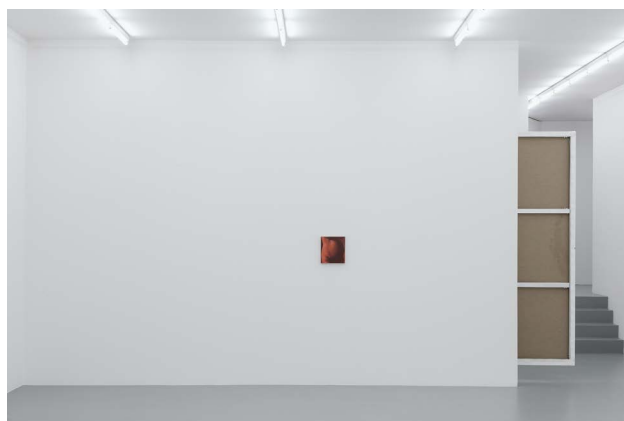
Installation view, Birth, Education, Leisure, Death, Giò Marconi, 2019.

You can expect to see paintings... and I imagine that there will be works on both a bigger and smaller scale. I'm working on new work in oil, in acrylic, and embroidery. There'll be very abstract works and also representational works including portrait painting, still life and perhaps some allusion to landscape. The paintings will most likely be very flat, and sometimes they will be shown behind glass.