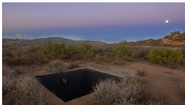
Installation view, Portrait of a Fat Man at Sunset, The Bunker, 2021.

Often in the painted versions and repetitions, you'll work into them with subtle differences. Some so faint and indecipherable viewers might not even notice on first glance. On looking closely at the rubber plant paintings, we notice imprints of hearts, achieved from pressing the wet surface with kitchen roll. What precisely are your aims with these painterly sleights of hand?