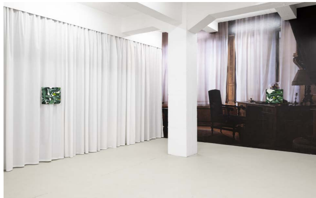
Installation view, More Birth, More Education, More Leisure, More Death, Peles Empire, 2019.