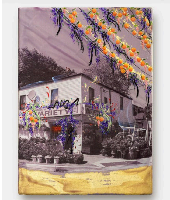
Elif Saydam, Bong's Variety, Oakville, Canada, 2023, 23k gold, inkjet transfer and oil on canvas, 30 x 21 cm; 11¾ x 8¼ in. Unique. | Elif Saydam

The works in Eviction Notice encompass painting, textile, installation, and photography. Drawing upon traditions of ornamentation outside of the European canon, Saydam considers the dynamics of desire extended to objects and social spaces.