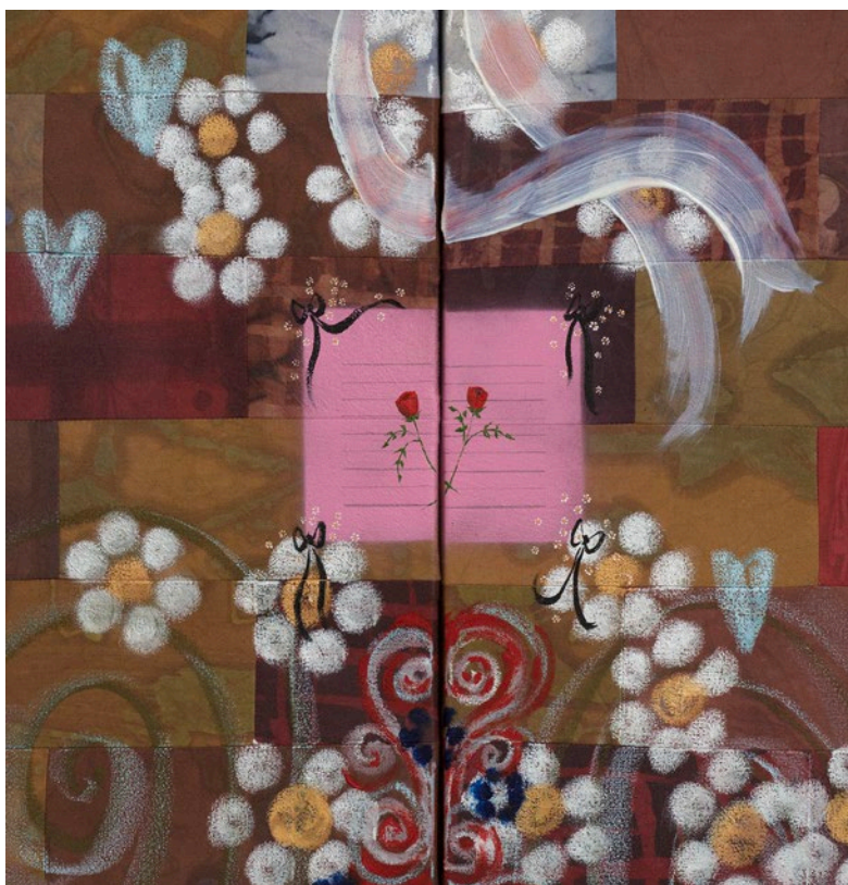
Elif Saydam, Getting the Slip, Hurling a Brick, 2023. Inkjet transfer, spray paint, oil pastel and oil on wax-resist dyed, machine-stitched canvas and linen, 4 panels, 168 × 238 cm; 66% × 93% in total. Unique. | Elif Saydam

Saydam examines the formation and judgment of aesthetic taste and the forces that influence them in their expanded painting practice. The artist approaches painting, understanding its entanglement with the social inequities in material culture.