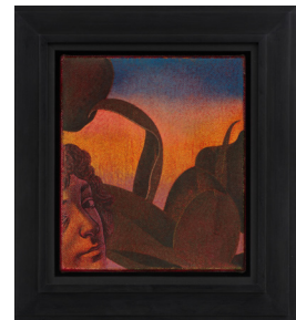
Fig. 1 Botticelli, 2023-24 Oil on herringbone linen 28x24 cm

2024 (fig. 3), is a multifigure composition using four angels from Botticelli's Raczyński Tondo (see fig. 1) as well as the same young boy that appears in o. T. (Cello Recital) (see fig. 2). Study for March, morning II , 2024 (fig. 4), began with a photograph on a Sunday morning in Berlin in March 2024. The final painting in the show, and the most recent, is Portrait of a Youth (after Filippino Lippi) , 2024 (fig. 5), which the artist created after the Filippino Lippi (c. 1457 - 1504) painting in the National Gallery of Art, Washington. The Lippi painting comes so close to Botticelli's style that there has been considerable disagreement among scholars as to exactly which artist is responsible for it. While it has frequently been attributed to Botticelli, most recent scholarship agrees that it is the work of Filippino.