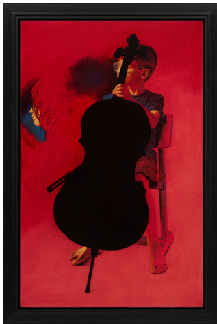
Fig. 2 o. T. (Cello Recital), 2024 Oil on herringbone linen 110.5x70.5 cm

The exhibition takes its name both from the artist Sandro Botticelli (c. 1445 - 1510) and from the game his name inspired. In the game Botticelli , one person or team thinks of a famous individual and reveals the initial letter of their name. Other players then ask yes or no questions to guess the identity, requiring a good knowledge of biographical details of famous people. The game takes its name from the principle that the chosen person must be at least as famous as Sandro Botticelli.