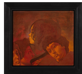
Fig. 3 Untitled, 2023 Oil on linen 40x45 cm