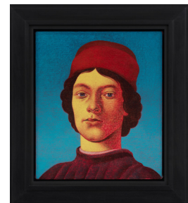
Fig. 5 Portrait of a Youth (after Filippino Lippi), 2024 Oil on herringbone linen 35x30 cm